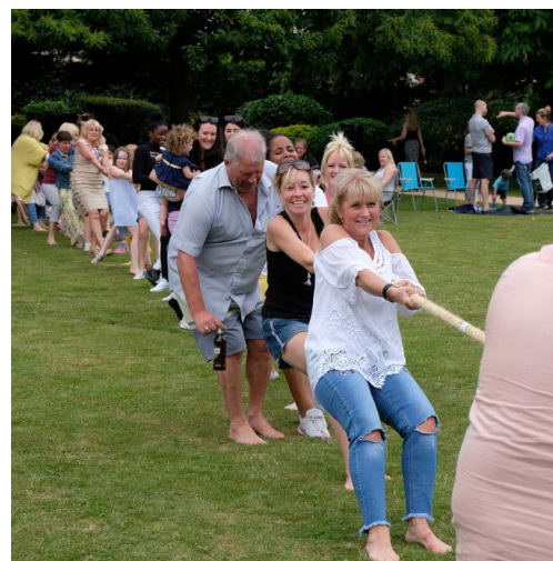
Fun Day - Tug of war